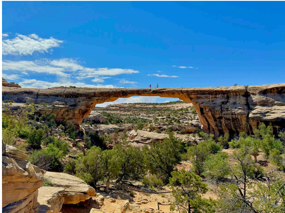
Owachomo Bridge National Bridges National Monument, Utah