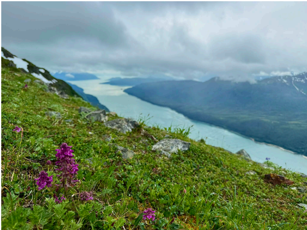
Gastineau Channel Juneau, Alaska