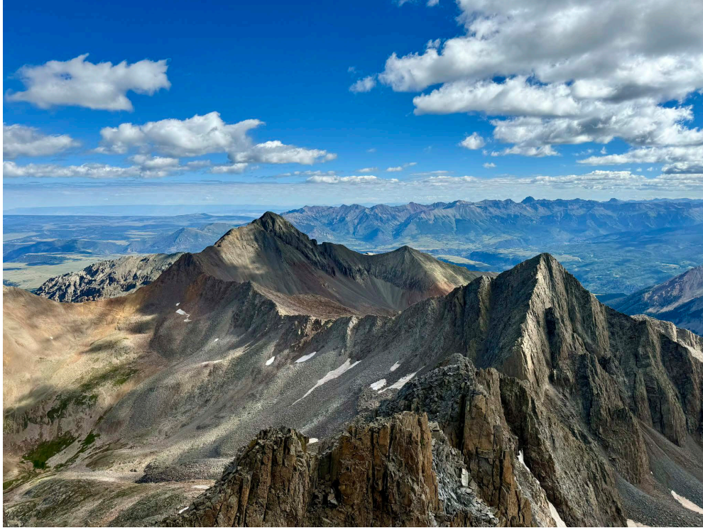
The Wilson Range Lizards Head Wilderness, Colorado