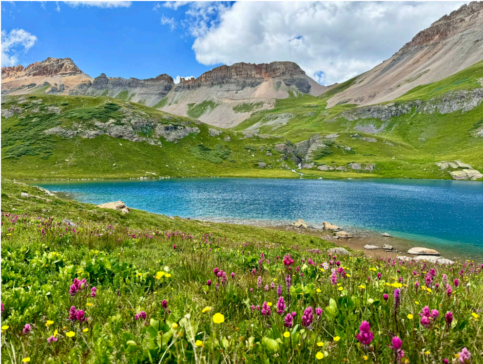
Ice Lake San Juan National Forest, Colorado