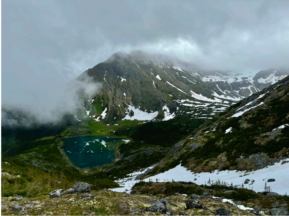
Upper Dewey Lake Tongass National Forest, Alaska