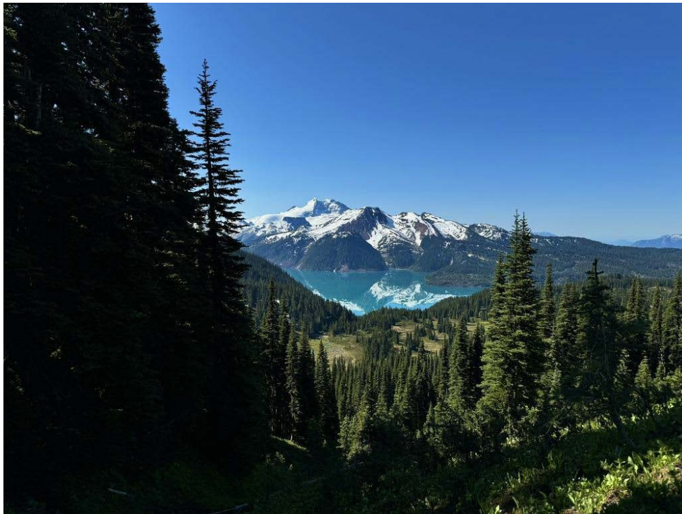
Garibaldi Lake Garibaldi Provincial Park, British Columbia