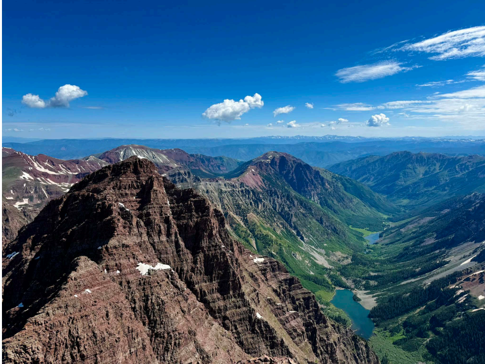
North Maroon Peak Maroon Bells-Snowmass Wilderness, Colorado