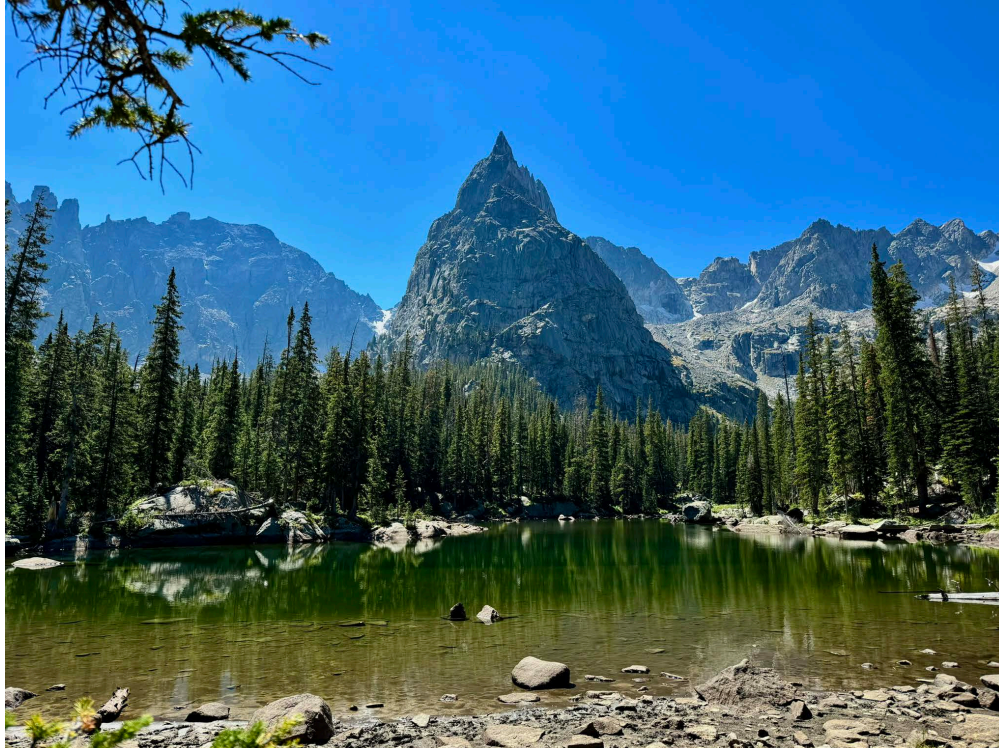
Lone Eagle Peak Indian Peaks Wilderness, Colorado