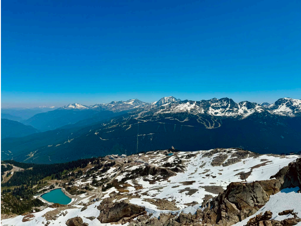
Blackcomb Mountain Whistler, British Columbia