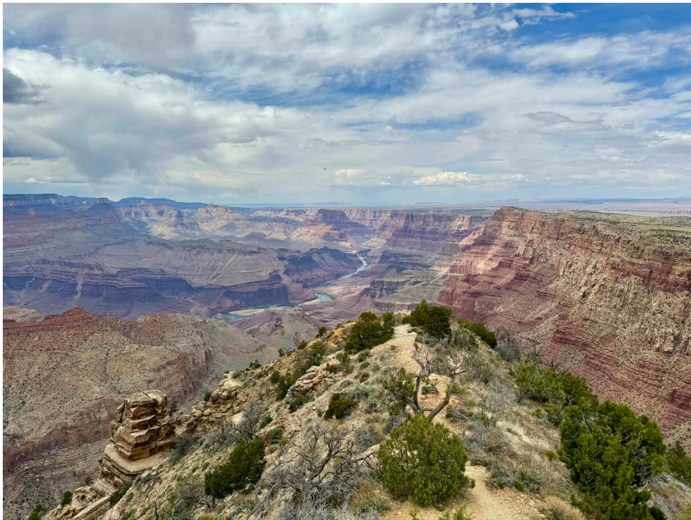
Desert View Watchtower Grand Canyon National Park, Arizona