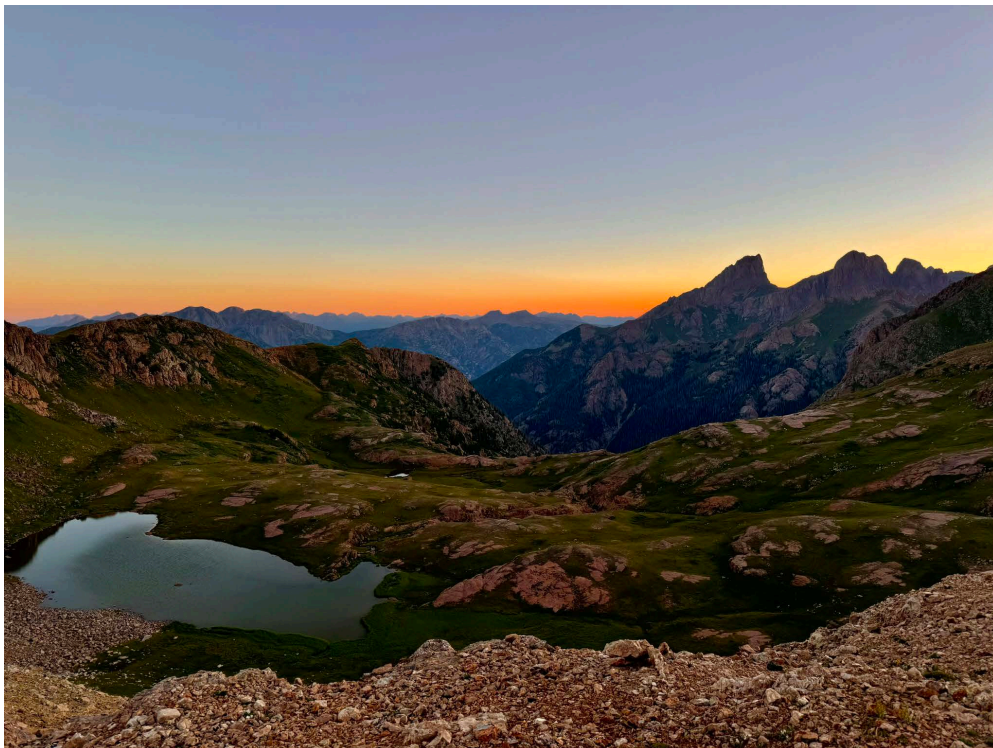
Chicago Basin Sunrise Weminuche Wilderness, Colorado