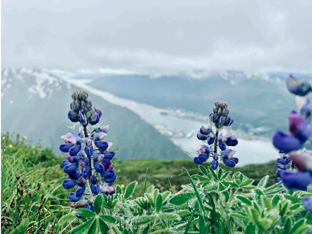
Mount Juneau Juneau, Alaska