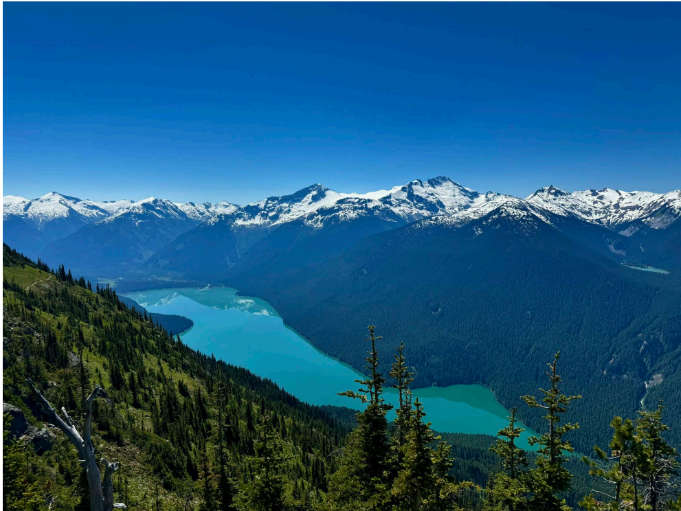
Cheakamus Lake Whistler, British Columbia