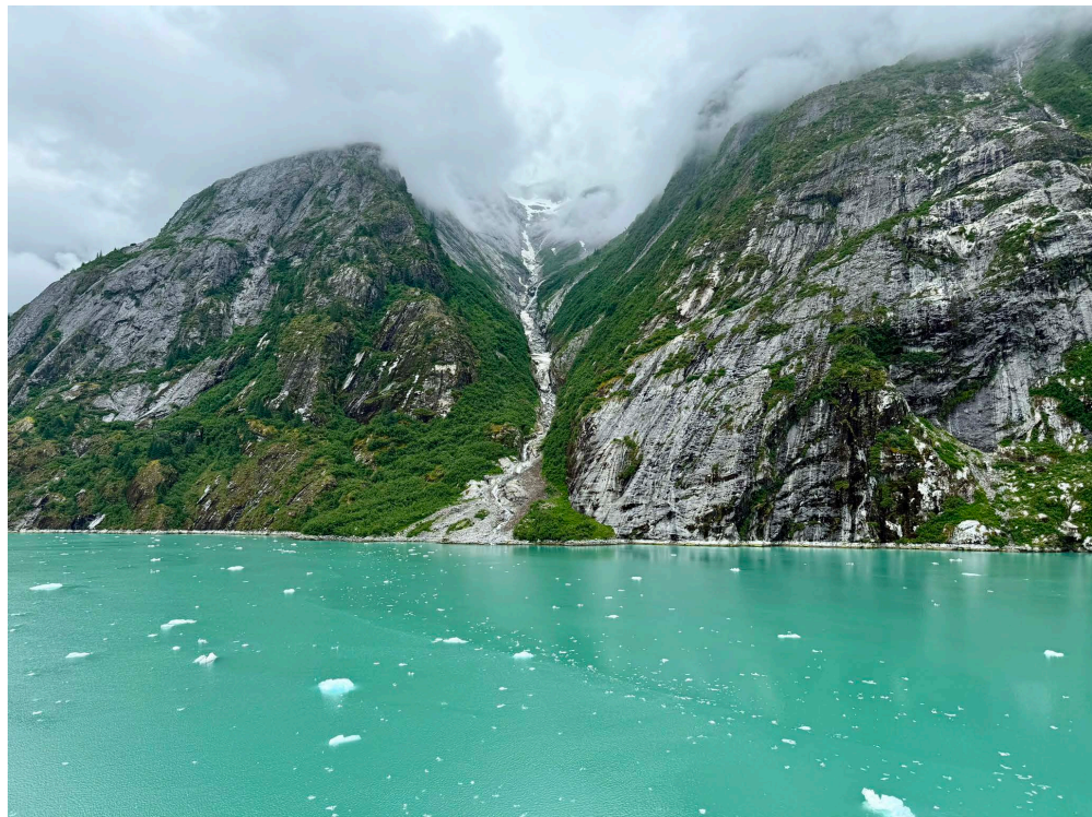
Endicott Arm Tongass National Forest, Alaska