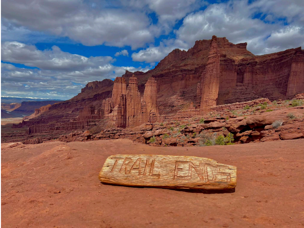
Fisher Towers Castle Valley, Utah