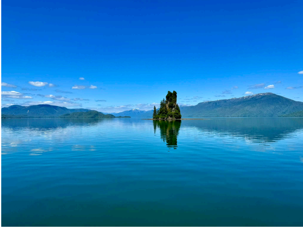
New Eddystone Rock Misty Fjords National Monument, Alaska