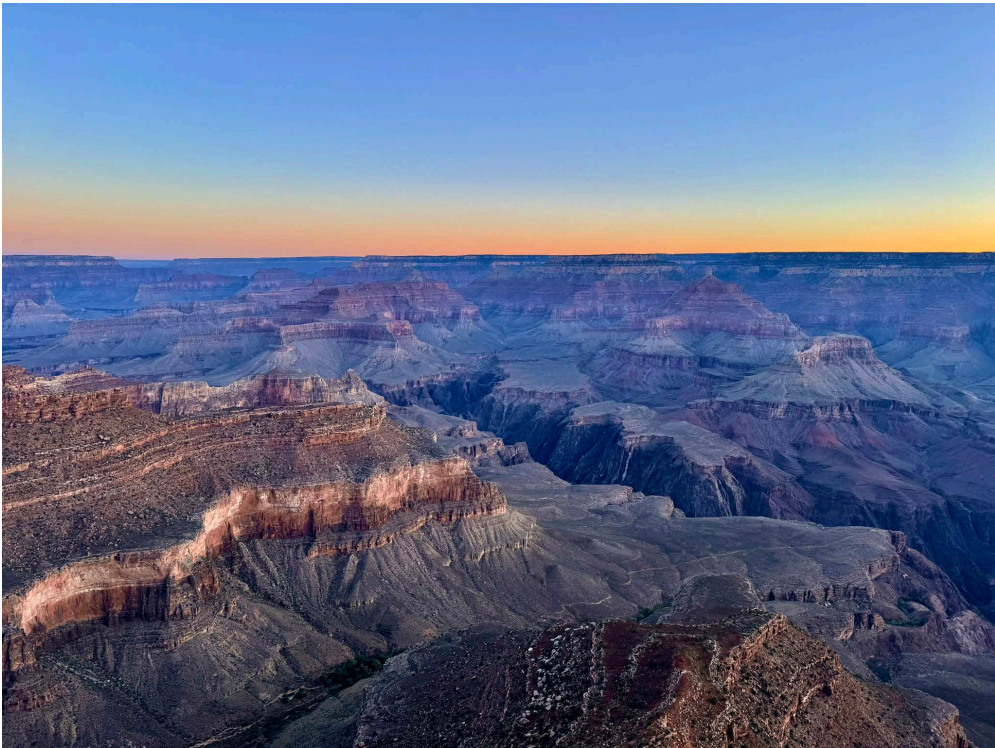
South Rim Sunrise