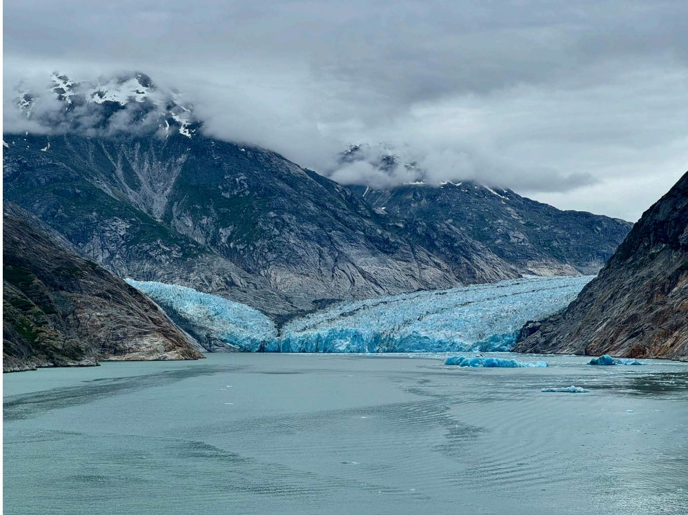
Dawes Glacier Tongass National Forest, Alaska