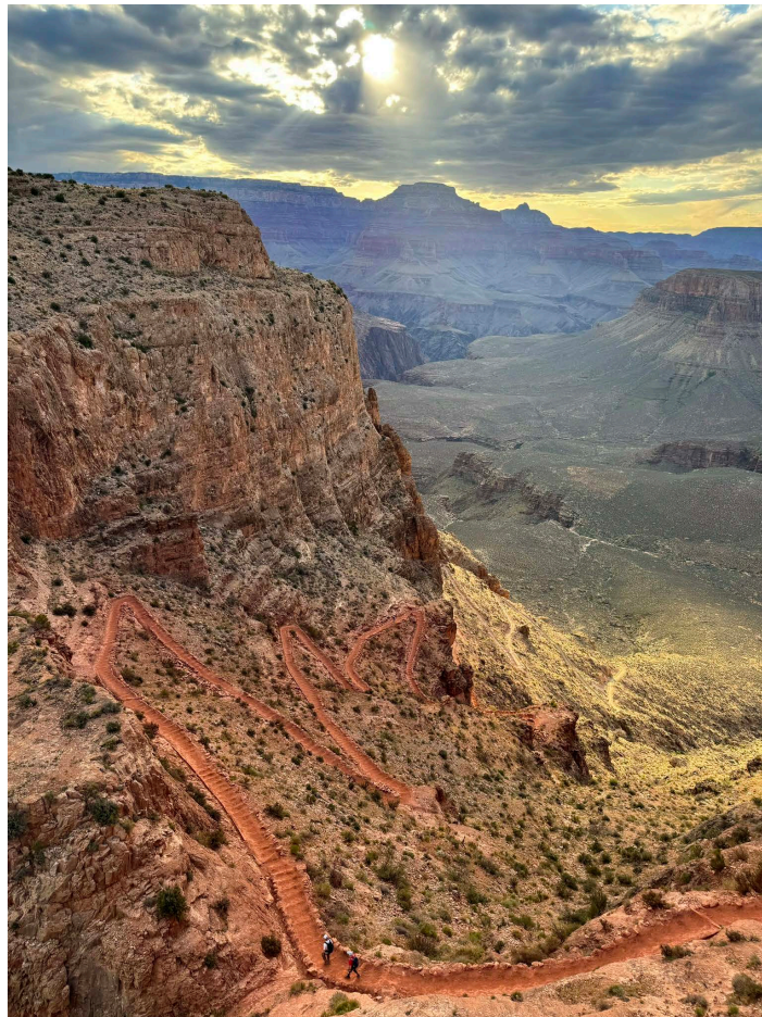
South Kaibab Trail

The arid environment of the American Southwest has been shaped by millions of years of erosion. Despite existing in an exceptionally sunny environment, a lack of accessible natural resources limits growth. Ongoing thermal heating, flash floods, and improving drought resistant flora continually alter the desert landscape.