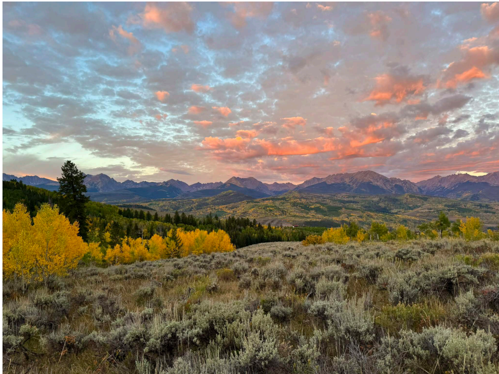
Gore Range Sunrise Ptarmigan Peak Wilderness, Colorado