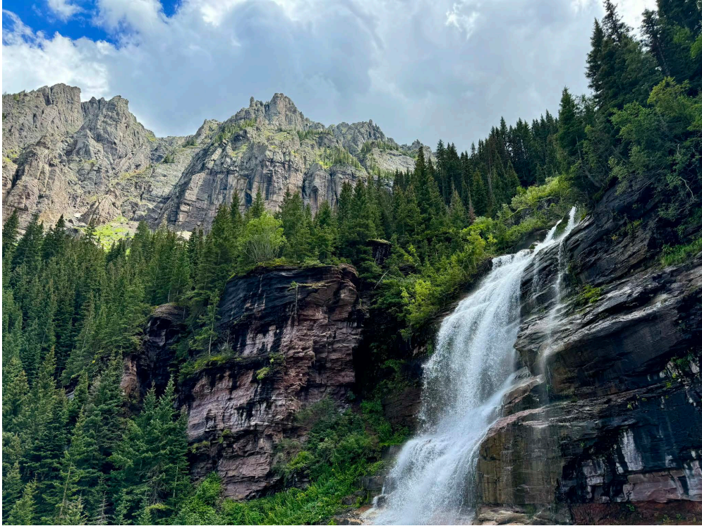
Bear Creek Falls