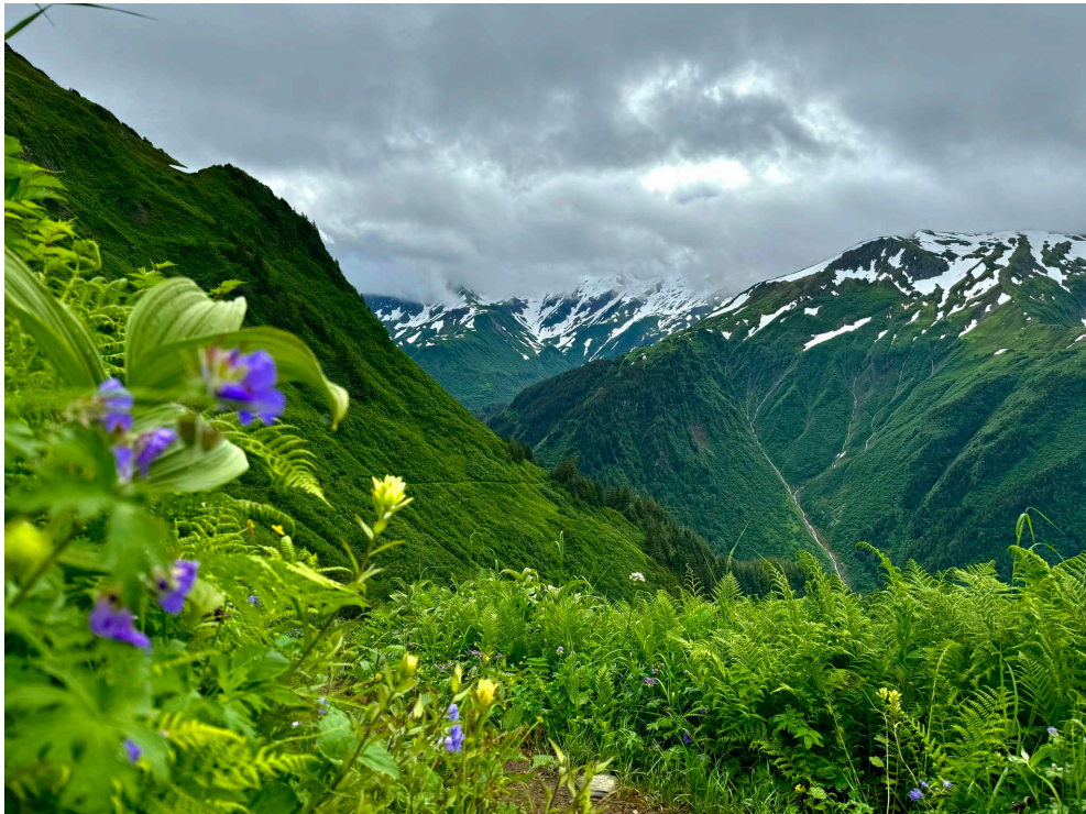
Gold Creek Basin Juneau, Alaska