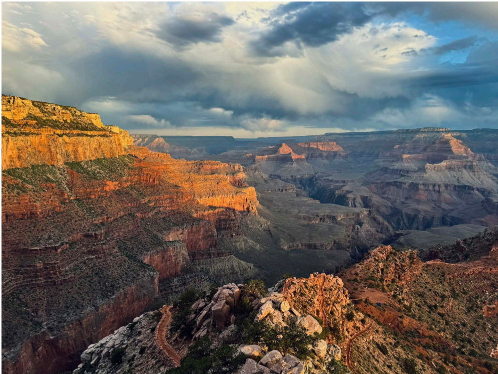
Ooh Aah Point