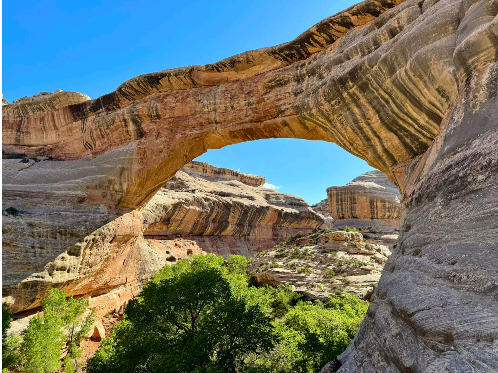
Sipapu Bridge National Bridges National Monument, Utah