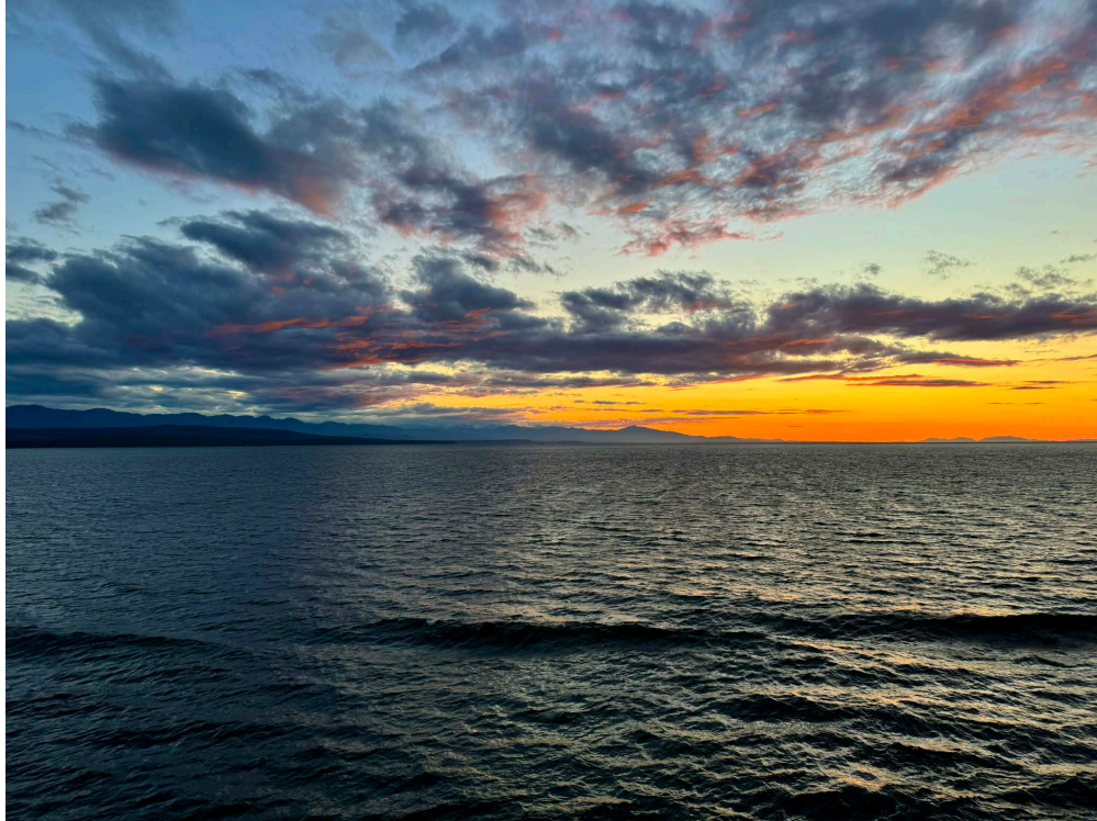
Burrard Inlet Sunset Vancouver, British Columbia