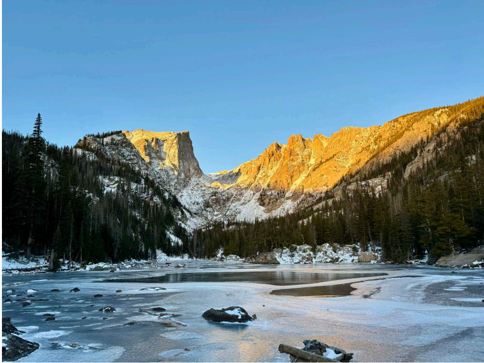
Dream Lake Sunrise