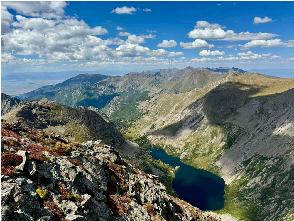
Adams Peak Sangre de Cristo Wilderness, Colorado