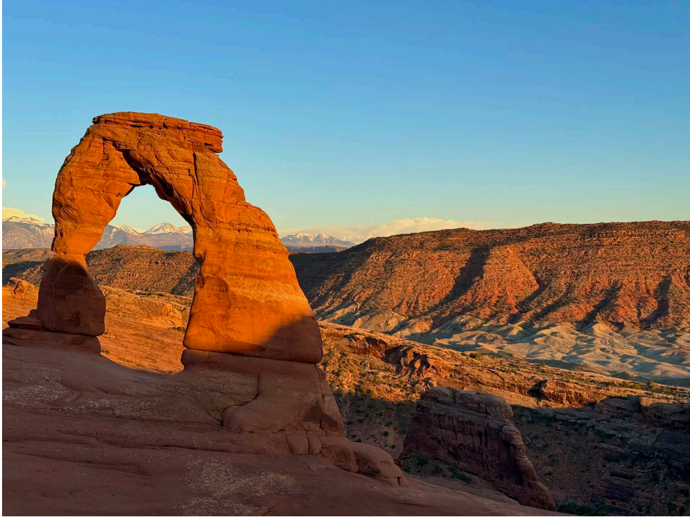
Delicate Arch Arches National Park, Utah