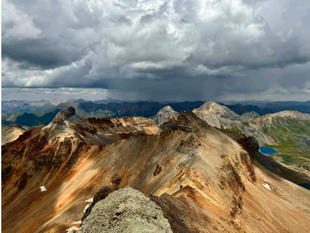
Vermilion Peak San Juan National Forest, Colorado