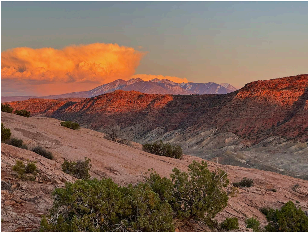
La Sal Mountains Manti-La Sal National Forest, Utah